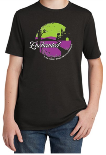
NOTE: All students participating in the recital will automatically receive a shirt